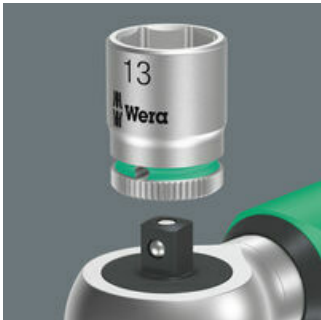
For 1/4" sockets

The Safe-Torque A 1 torque wrench has 1/4" square head mounting and is suitable for 1/4" sockets.