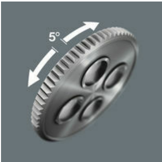
Low return angle

The fine-toothed Safe-Torque torque wrench with 72 teeth has a back-pivoting angle of only 5°. The small stroke offers quick and precise working in all installation positions.