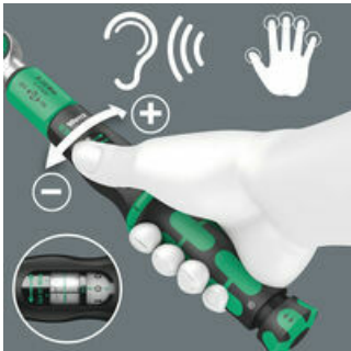
Easy torque setting

Easy setting and saving of the required torque with audible and tactile clicks on reaching the scale values.