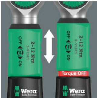
Torque Lock function

The torque function can be deactivated. The Safe-Torque torque wrench can then also be used as a standard ratchet with high loosening moments and for applications with defined angles of rotation.